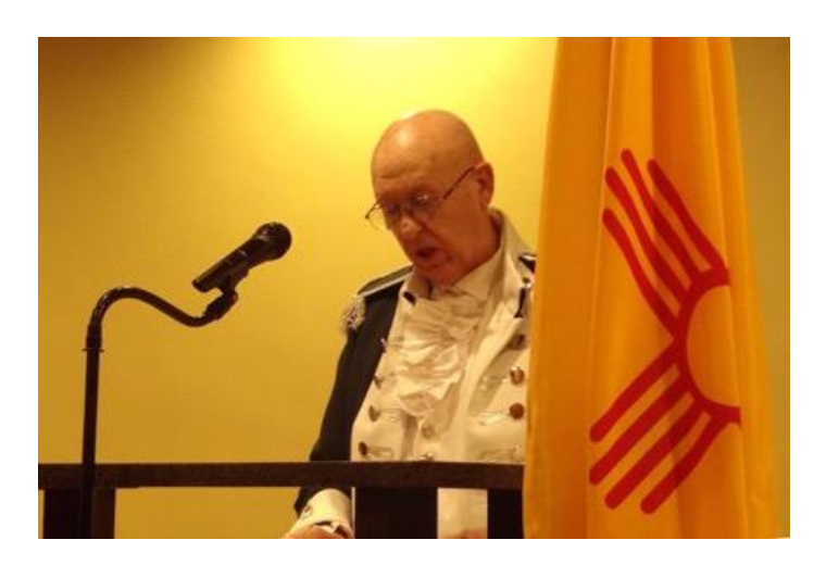
Compatriot Lyngar wasted little time in getting down to NMSSAR business. There are presently four Chapters in New Mexico, with the